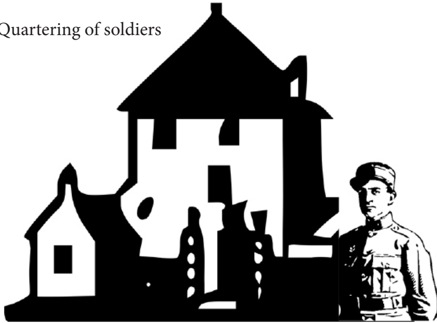
Quartering of soldiers