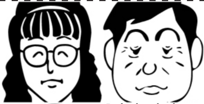
Rights kept by the people