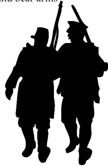
Right to keep and bear arms